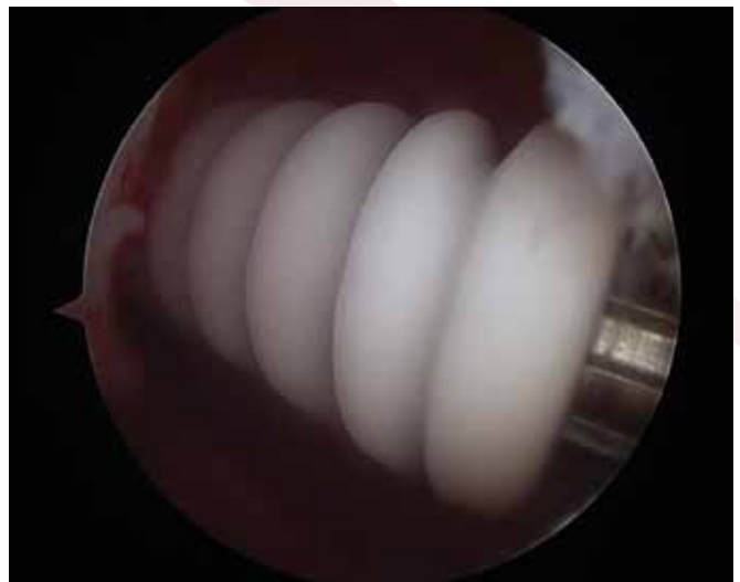
Figure four: Bioabsorbable screw for ACL fixation