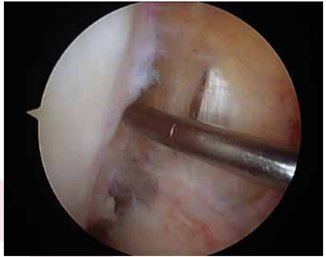
Figure three: Arthroscopic photo – ACL tear – “empty notch”

3. Sun K, Tian S, Zhang J, Xia C, Zhang C, Yu T. Anterior cruciate ligament reconstruction with BPTB autograft, irradiated versus non-irradiated allograft: a prospective randomized clinical study. Knee Surg Sports Traumatol Arthrosc 2009;17(5):464-74.