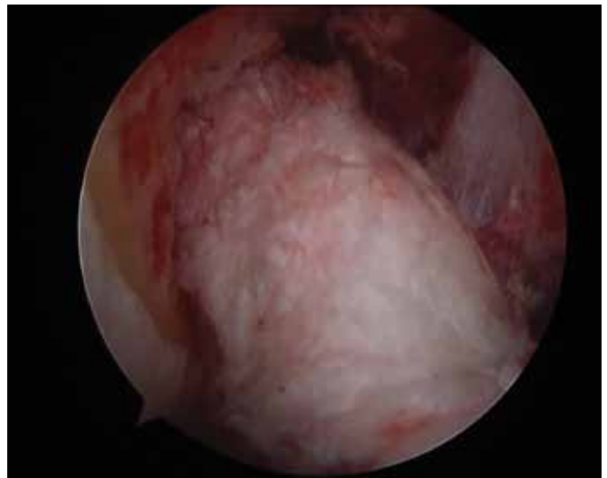
Figure five: ACL reconstruction