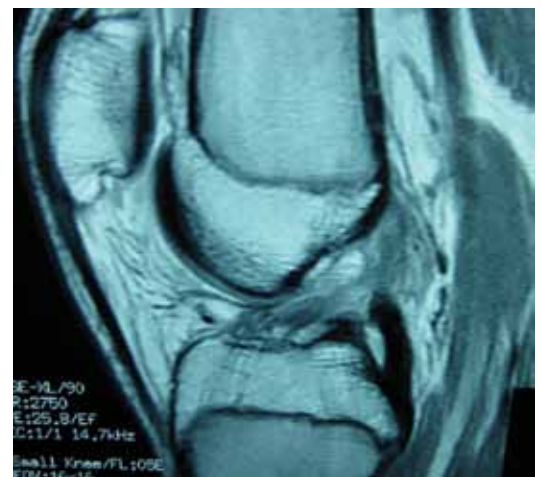
Figure two: MRI – ACL tear

treatment is reserved for individuals who do not have symptoms of instability and do not plan on returning to high-level activities.