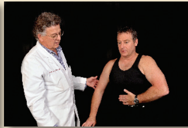
Belly-Press Test (push against belly/abdomen) Positive: if the elbow moves backwards, it demonstrates weakness of the internal rotators - subscapularis Negative: if the rotator cuff is intact, the arm remains stable