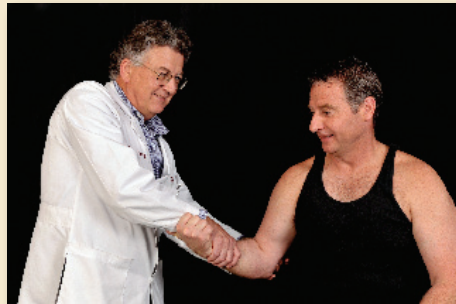
To determine the stability of the long head of the biceps