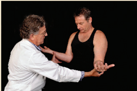
Check both arms at the same time