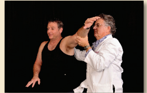
For the rotator cuff under the acromion to determine if impingement is present