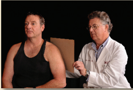
AP of the shoulder without moving the shoulder