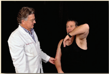
Hornblower's Sign which demonstrates weakness of the external rotators