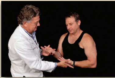
To determine external weakness specifically