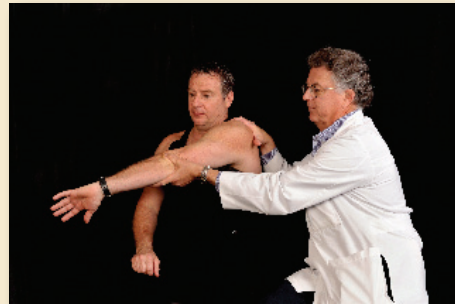
To determine labral tear (Superior – Labral – Anterior – Posterior)