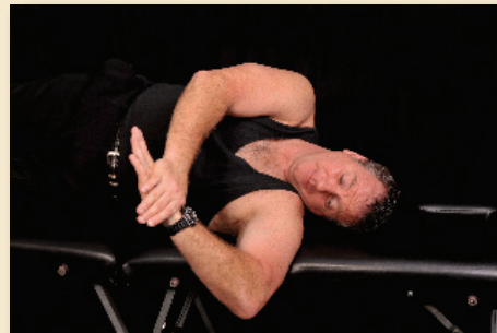
Exercise performed by patient to gain range of internal rotation