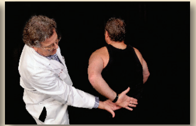
Lift-Off Test Positive: if weak, the hand cannot be lifted off of the back by the patient; this indicates a subscapularis tendon tear Negative: if the rotator cuff is intact, the hand can lift-off the back